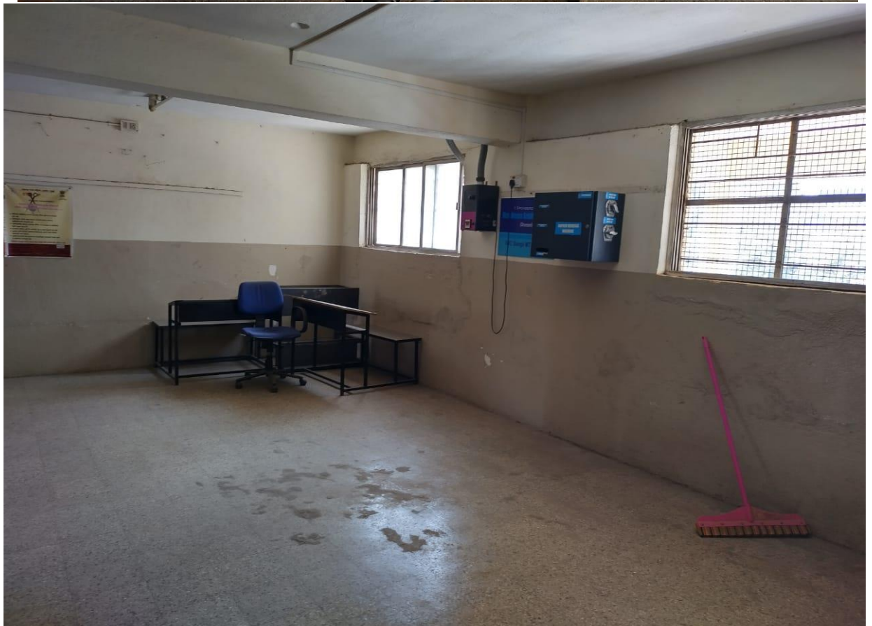
Common Room With Disposal Machine